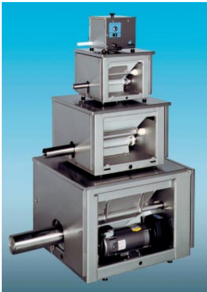
Top to bottom: Models 102, 302, 602 and 902.

The Model 12 is a sanitary design, encompassing quick disassembly features for easy cleaning.